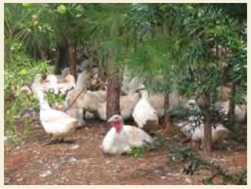
Figure 67 a and b: Ducks and sheep with turkeys in the grazing paddock

Predators. A 10 wire electric fence keeps foxes out and usually keeps the Mareema guard dog in with the grazing birds; one dog was an exception because it preferred to jump the electric fence and spend time with the family in the house, rather than do its job and protect the turkeys from predators. The best dog that Matthew had for protecting the turkeys was a cross between a Mareema and an Okshanka. Unfortunately over the years, guard dogs have been killed by ticks, snakes and a few unknown causes.