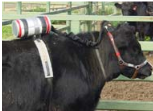
Cattle being measured for methane