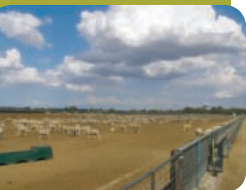
The lamb feedlot in Riverina RLPB.

A small treatment trial using injectable long-acting oxytetracycline resulted in 20% of both the treatment and control groups dying within 24 hours of treatment. Another 20% of the control group died the following week, but losses ceased in the treated lambs for 2 weeks after treatment. From 2 to 4 weeks after the treatment trial approximately 10% of lambs in the control group and the treatment group died.