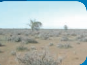
Dry pasture dominated by Ward's weed.