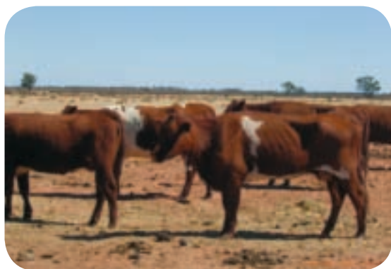
Cattle with suspected salmonellosis suffered weight loss and exhibited a stiff, weak, hindlimb gait.

Salmonellosis was suspected as the primary disease that killed 59 calves and more than 20 mature cattle in an isolated mob of 140 in south-western NSW over a 4-month period. Salmonella havana and Salmonella adelaide were cultured from a range of tissues, and Salmonella adelaide was isolated from water and mud samples.