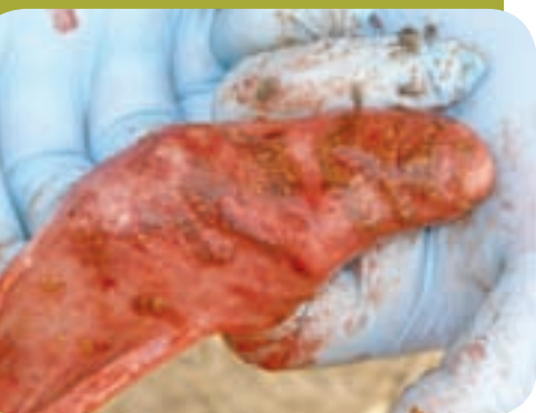
Haemorrhagic caecum from an affected lamb.