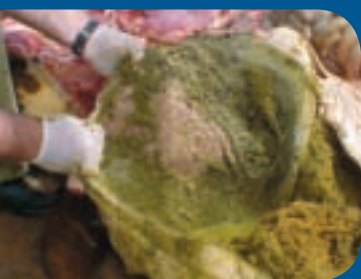
Rumenitis and Ward's weed stalk material in the rumen.