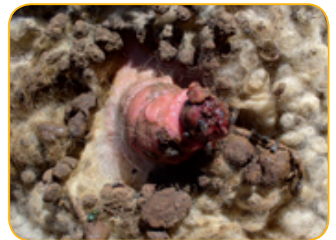
Balanitis in a Border Leicester ram.

Two weeks later, with the problem persisting, veterinary examination found the rams were all in good body condition and could urinate, although one at least was observed to dribble urine rather than excreting a controlled stream. Some had paraphimosis (inability to withdraw the penis), and all had ulceration, purulent exudate, abrasion and swelling of the glans penis.