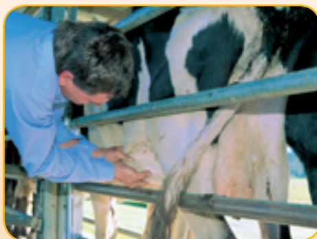
Tick surveillance is critical to the prevention of tick fever.

Tick eradication programs have commenced on the properties where cattle ticks have been detected, as NSW has a policy of tick eradication when outbreaks are detected.