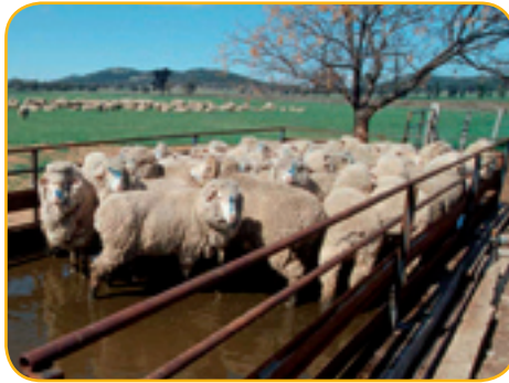
Sheep in a footbath. Footrot causes major production losses and management difficulties.

In 2007 there were 333 lameness investigations undertaken across 27 Boards, compared with 273 investigations the previous year. Excluding the Hume Board, which reported 120 lameness investigations, the average number of investigations per Board was 10.