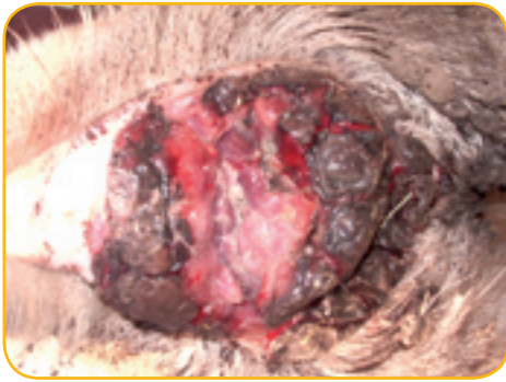
Squamous cell carcinoma around the perineum in a Boer goat.

For further information contact Shaun Slattery, DV Narrabri RLPB, on (02) 6792 2533.