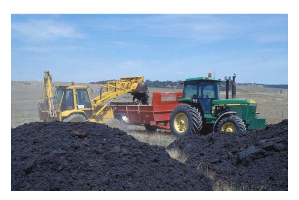
Figure 5. Spreading Compost.

Avert cross contamination of feed with manure by farm equipment. Use a separate skid steer or loader bucket for manure, compost and feed operations or clean thoroughly before using on feed. Maintain clean water troughs, water bowls, and feed mangers.