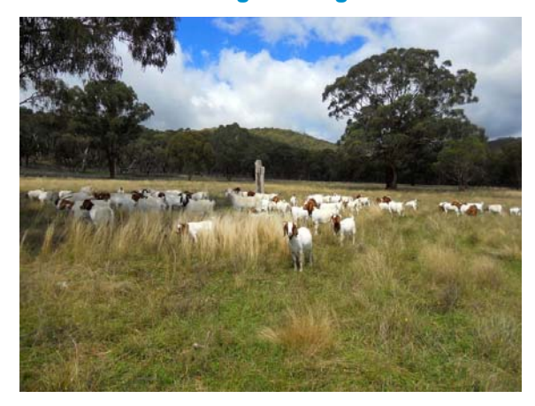
Figure 2. Boer goat herd.

All the precautions in the world will not help you if you don't have good fences. Good fences keep your stock in, and other stock, which may spread diseases and weeds, out.