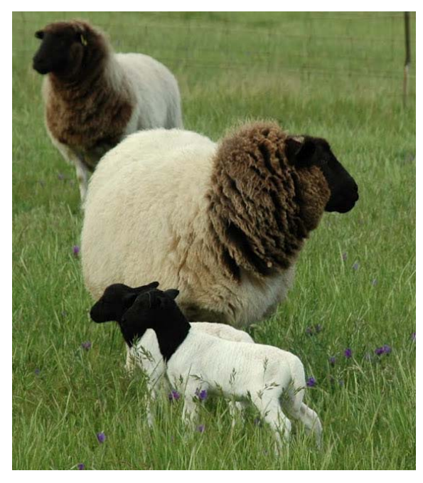
Figure 1. Dorper ewes with lambs.

Karen Omalley, IDO Organic Farming, Bathurst NSW