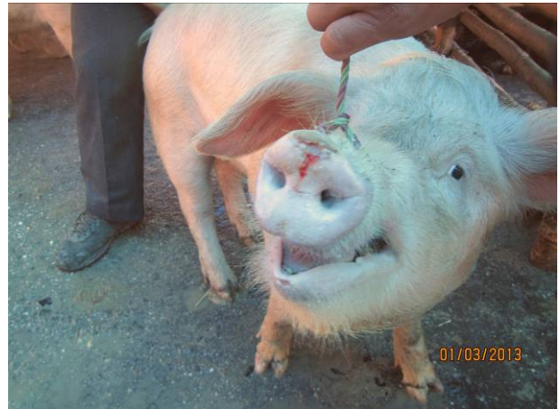
Figure 4: Ulcerated snout lesion in a resident pig.

In cases where the symptoms are severe it is unlikely that the disease would be missed as the effects on production and welfare would be obvious. However in a situation with mild disease or where pigs are not closely observed nor their performance measured there is a risk of disease being present but not being noticed or investigated.