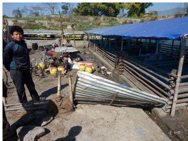
Figure 2: One of the pigs sheds. Swill deliveries are in the small yellow pots.

There was no biosecurity in place at the piggery, with uncontrolled movements of people and things throughout the complex. The slaughterhouse killed both pigs grown on the farm and others sourced