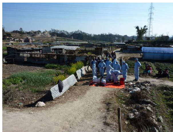
Figure 1: Australian vets observe biosecurity protocols in Nepal.

The feed was ‘swill’ collected from a nearby army barracks, and city hotels. It was fed as collected, with no cooking or treatment. Mustard seed was sometimes added as a supplement.