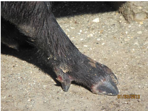
Figure 3: FMD foot lesions early in the infection are not that obvious.

In the very early stages of an FMD outbreak, there may only be small numbers of affected animals. Depending on the strain (or variety) of FMD virus involved the symptoms could be very mild.