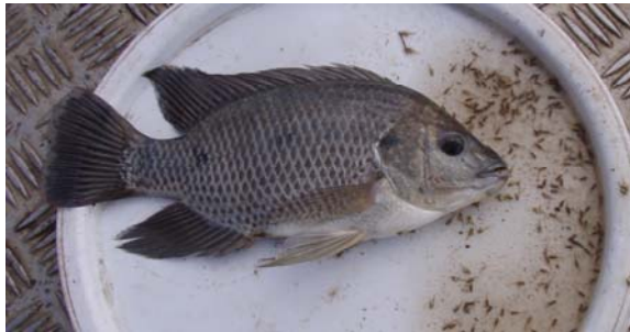
Mouth brooding female Mozambique tilapia.

Mozambique tilapia is a freshwater pest fish currently known to occur in southern Qld. Tilapia originate from southern Africa. They are very adaptable fish with a successful breeding strategy (mouth brooding) which make them a significant threat to NSW waterways. Tilapia has the potential to out-compete native species, disturb aquatic habitats and water quality and reduce the social, economic and environmental value of a waterway. Tilapia is dark silver to grey in colour and can be distinguished by their long continuous dorsal fin, which ends in a point. Please report suspected tilapia sightings to Aquatic Biosecurity NSW DPI 02 4916 3877