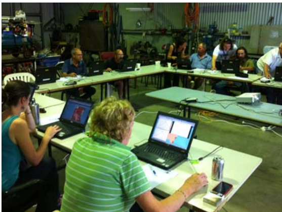
Portal Workshop with Shoalhaven oyster growers