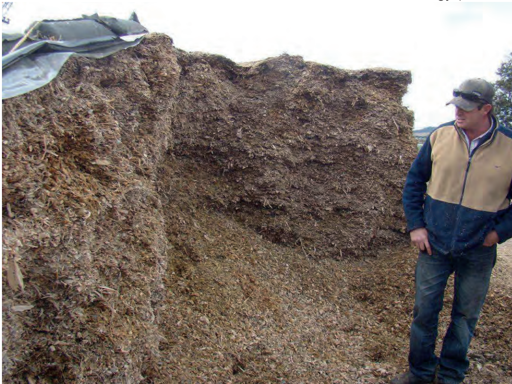
Photo: Tim Freeman inspecting maize silage at the Denman Topfodder Update earlier this year

With grain prices going up it will be more important than ever to have high quality home grown forage available and maize can do this on some farms. Alternatives such as grain sorghum or soybean would only be grown where maize is unsuitable.