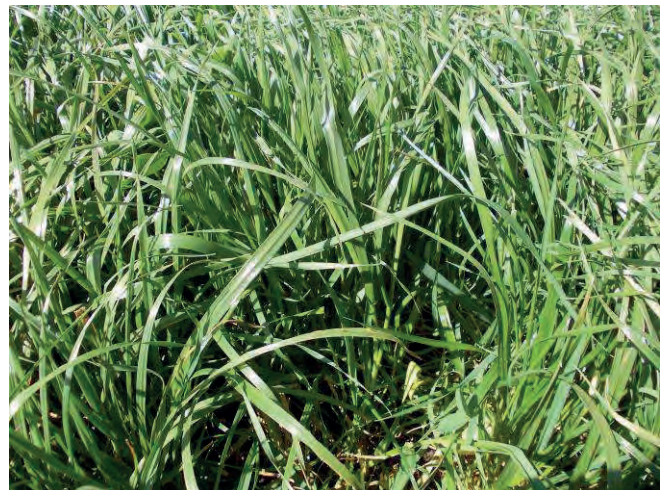
Photo: Ryegrass ready to ensile

Cutting ryegrass at the boot growth stage (when you can feel nodes on the stem but seed heads have not emerged) is usually the best compromise between yield and feed quality.