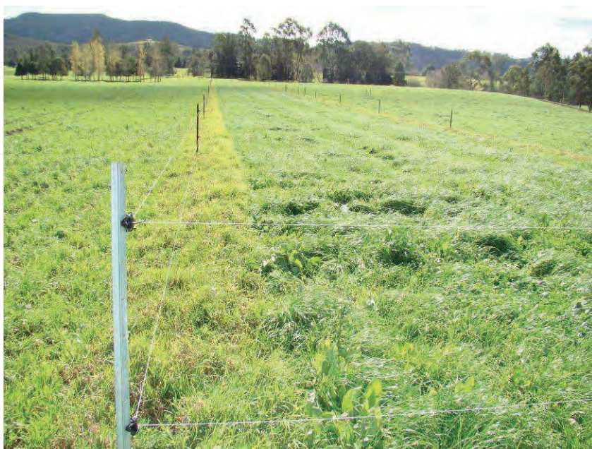
Photo: Nitrogen topdress trials conducted at Tocal in 2009 and 2010