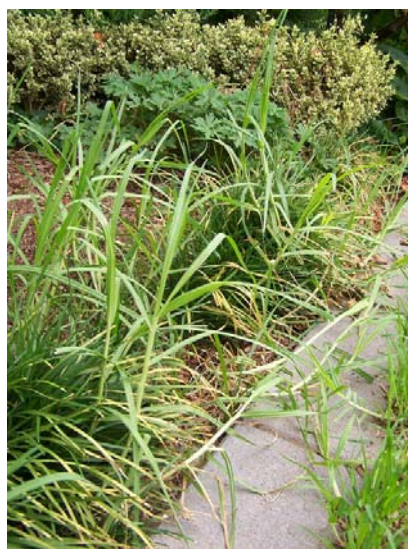
Creeping grasses such as kikuyu become weeds when they invade garden beds.