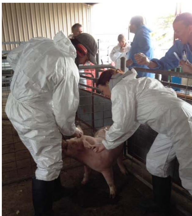
Figure 1: Pork industry skill set trainees learn how to restrain a pig with a snare whilst giving an intramuscular injection.

The cost of the course is $300 - $400 per person, depending on whether you qualify for government-assisted funding. For more information or to enrol in future courses contact Mr Harry Gillis at GoTafe on PH 0428530675.