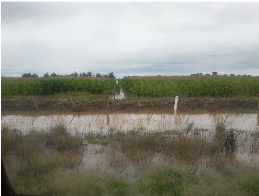
Water laying in a maize paddock in Blighty.

A number of southern Riverina dairy farmers grew maize crops this year, to capitalise on the good water availability, and to build up reserves of good quality silage. Little did they know that the region would cop up to 350 mm of rain in late February and early March, causing significant flooding.