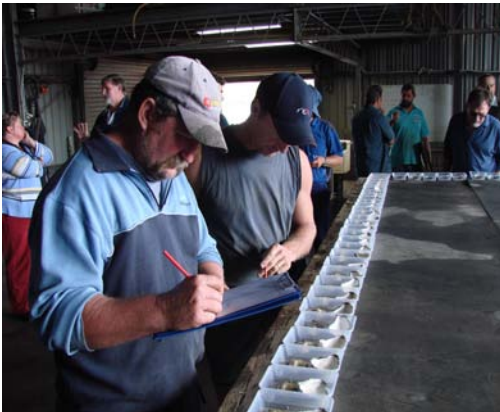
Farmers assessing condition of QX resistant oysters from the Kimmerikong harvest area.