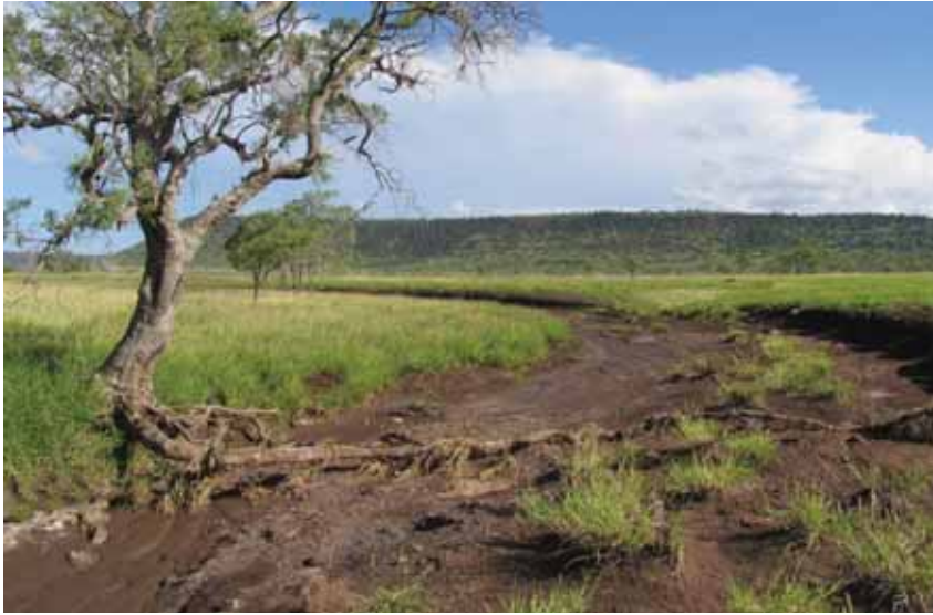
A drainage line in buffel grass ( Cenchrus ciliaris ) pasture on heavy clay alluvium near Springsure, central Queensland.