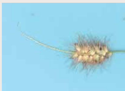
Shedding seed head, with zigzag axis. Image: M.Robertson