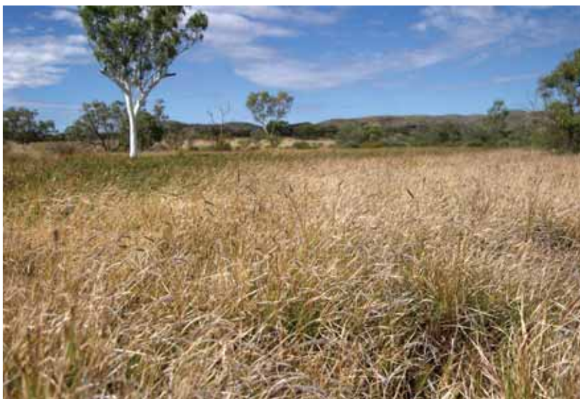
Buffel grass ( Cenchrus ciliaris ) infestation on calcareous loamy soil along a creek in Karijini NP, WA.

Buffel grass seed may survive for up to an estimated 4 years in the soil, but plants can live for many years (possibly up to about 20 years). In drier locations, moisture levels sufficient for high seed production, or for widespread germination and plant establishment, may occur infrequently. The variable climate may result in a dynamic distribution of buffel grass across the landscape, with drier sites being recolonised from moist refuges after prolonged drought.