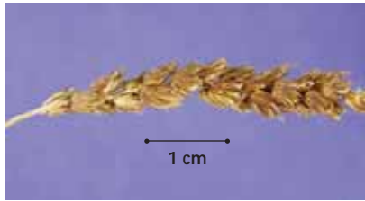
Birdwood grass ( Cenchrus setiger ) seed head lacks long, fine bristles.

Buffel grass is a long-lived tussock grass with a deep, tough root system. While some cultivars can grow up to