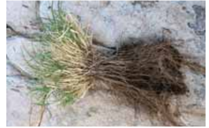
Buffel grass ( Cenchrus ciliaris ) plants have extensive roots.

Cenchrus species that are declared in one or more Australian states are: C. biflorus (Gallon's curse); C. brownii (fine-bristled burr grass); C. echinatus (Mossman River grass); C. incertus , synonym C. pauciflorus (spiny burrgrass); and C. longispinus (spiny burrgrass or gentle Annie). These species may also be known as innocent weed or hedgehog grass.