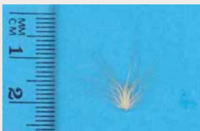
Burr.