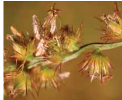
Mossman River grass ( Cenchrus echinatus ) is a spiny annual weed in both northern and southern Australia.

The introduced perennial pasture species, buffel grass ( Cenchrus ciliaris ), Birdwood grass ( C. setiger ) and Cloncurry, white or slender buffel grass ( C. pennisetiformis ) have burrs that lack sharp, rigid spines. They are closely related—in fact C. pennisetiformis and C. ciliaris are sometimes considered to be the same species. Alternative species names for the buffel grasses are Pennisetum ciliare , P. setigerum and