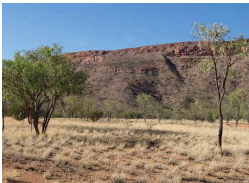
Buffel grass ( Cenchrus ciliaris ) can dominate the understorey in arid regions. Central Australia, NT.