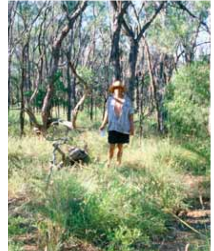
Buffel grass invasion of intact gidgee / brigalow in Mazeppa NP, central Queensland.

high (leaves are bright green and glossy), and the herbicide applied to as much green foliage as possible. The period when conditions are suitable may be short. Spot spray using hand-held equipment (handgun and hose or knapsack) to avoid off-target damage. Persistent dry foliage may shield fresh growth. Follow up is essential using the same or other treatment methods.