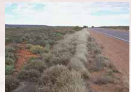
Buffel grass ( Cenchrus ciliaris ) along the highway near the Flinders Ranges, SA.

© 2008 Information which appears in this guide may be reproduced without written permission provided the source of the information is acknowledged.