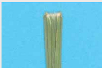
Ligule at the junction of leaf blade and sheath is a fringe of hairs, 0.2–2 mm long.