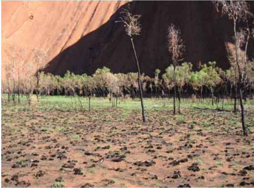
Buffel grass ( Cenchrus ciliaris ) burnt butts resprouting after summer rain. Uluru, NT.