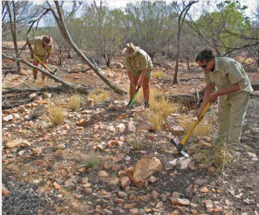
Chipping individual buffel grass ( Cenchrus ciliaris ) tussocks in Alice Springs Desert Park, NT.

At the start of the program, it was not known whether removal of buffel grass could be achieved. Also unknown was the likely vegetation response to its removal. In fact, there has been