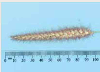
Flowering head.