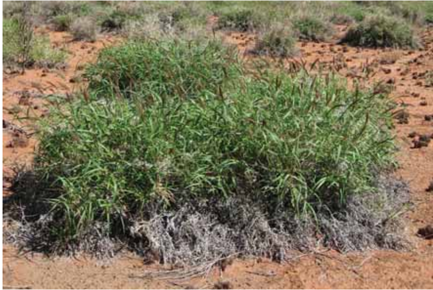
Mature buffel grass ( Cenchrus ciliaris ) tussocks grow rapidly after summer rains. Uluru NT.