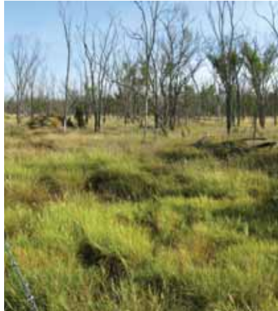
The edge of Mazeppa NP, central Queensland 5 years after a hot fire fuelled by buffel grass damaged the tree canopy, promoting further invasion.

To be effective, spraying should be undertaken when the growth rate is