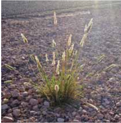
Native species: black bottle-washers ( Enneapogon nigricans ).